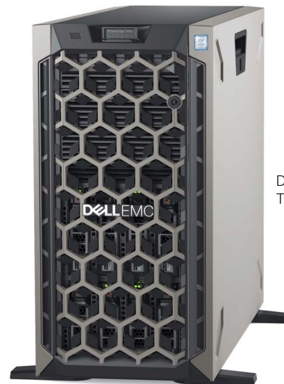
Dell EMC PowerEdge T440 Tower Server